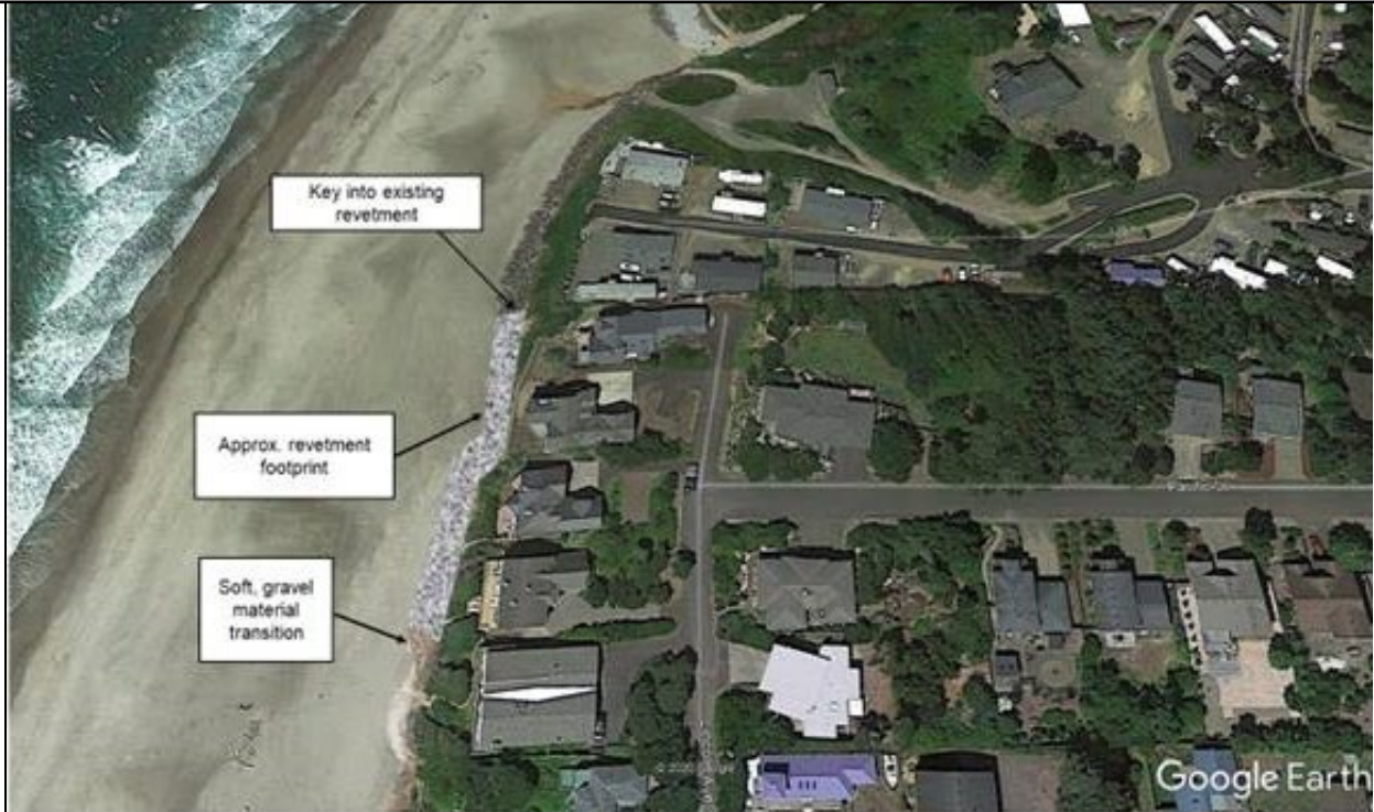
Conceptual plan view of armor rock revetment at Individual Oceanfront Homes (Allied Properties); footprint approximately 14,500 square feet.

Amending the Lincoln County Comprehensive Plan adopting an exception to Statewide Planning Goal 18, Implementation Requirement 5 ("Goal 18, IR 5"). The exception would allow for the placement of beachfront protective structures on property in Gleneden/Lincoln Beach that is otherwise ineligible under IR 5, for protective structures (Case File No. 03-LUPC-21) -- Exhibit 2